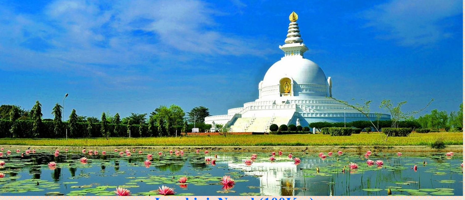
Lumbini, Nepal (100Km)