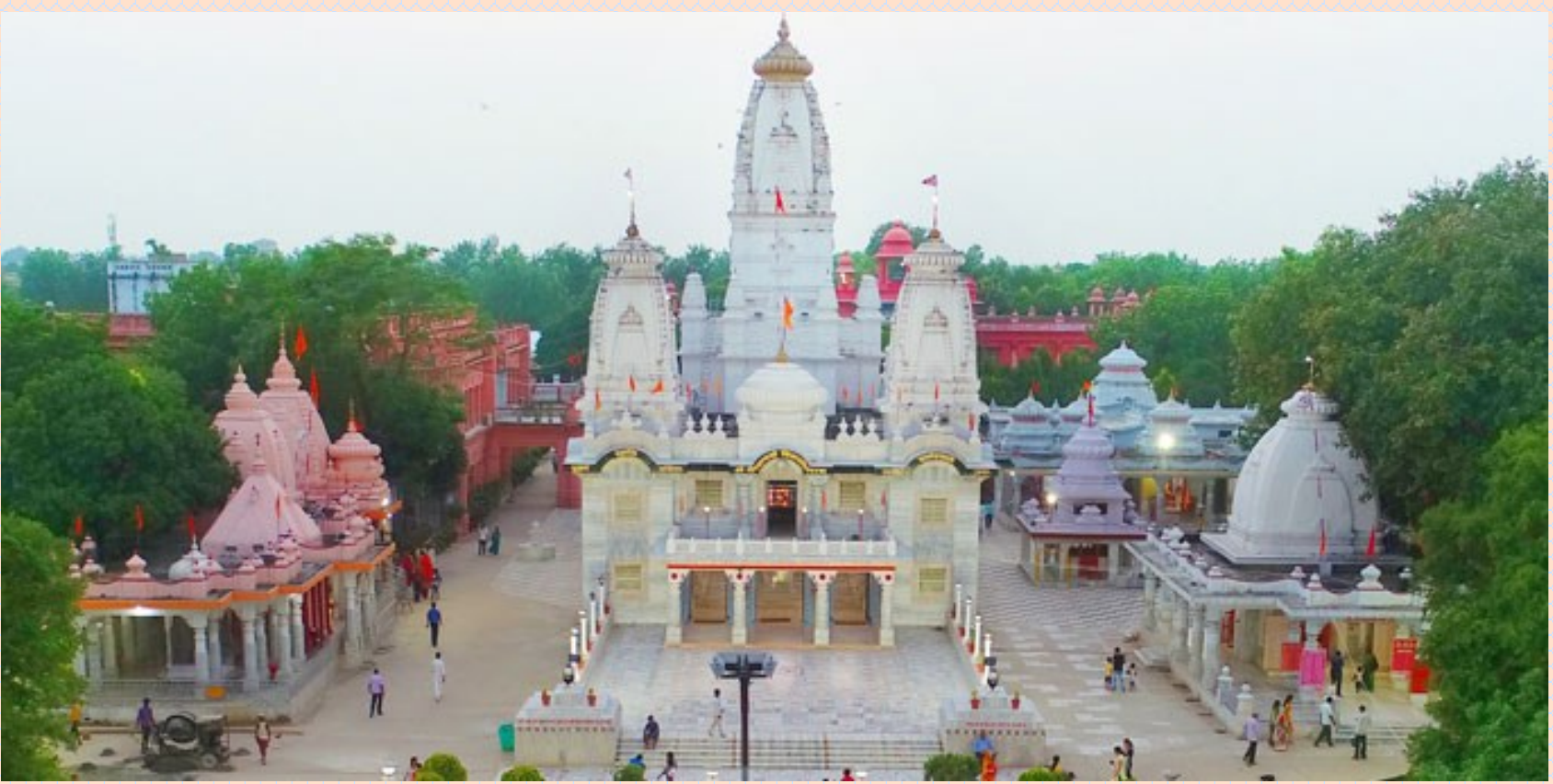
Shri Gorakhnath Mandir, Gorakhpur