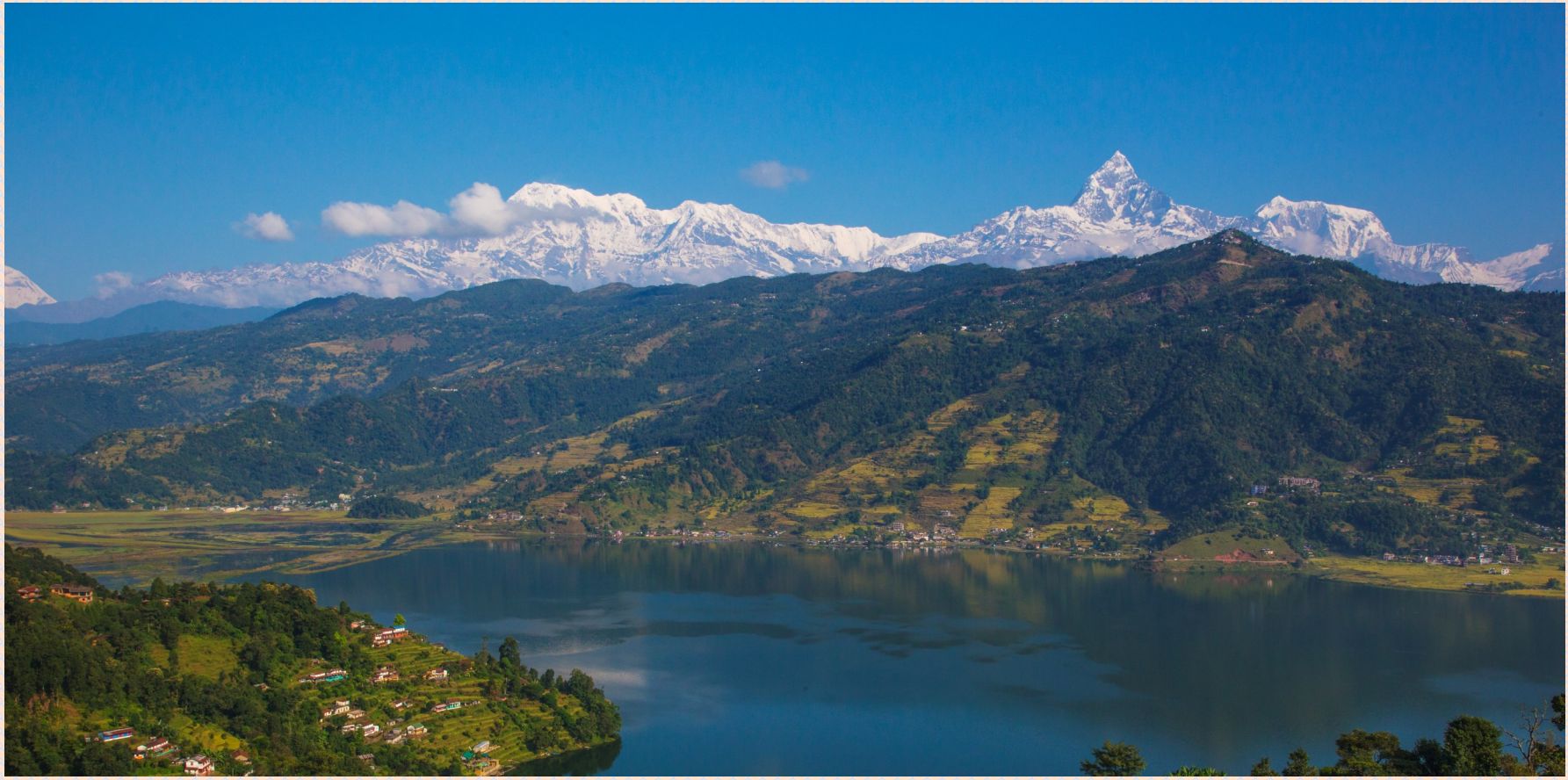
Pokhara, Nepal - Annapurna Himalayan Hill Range (250Km)