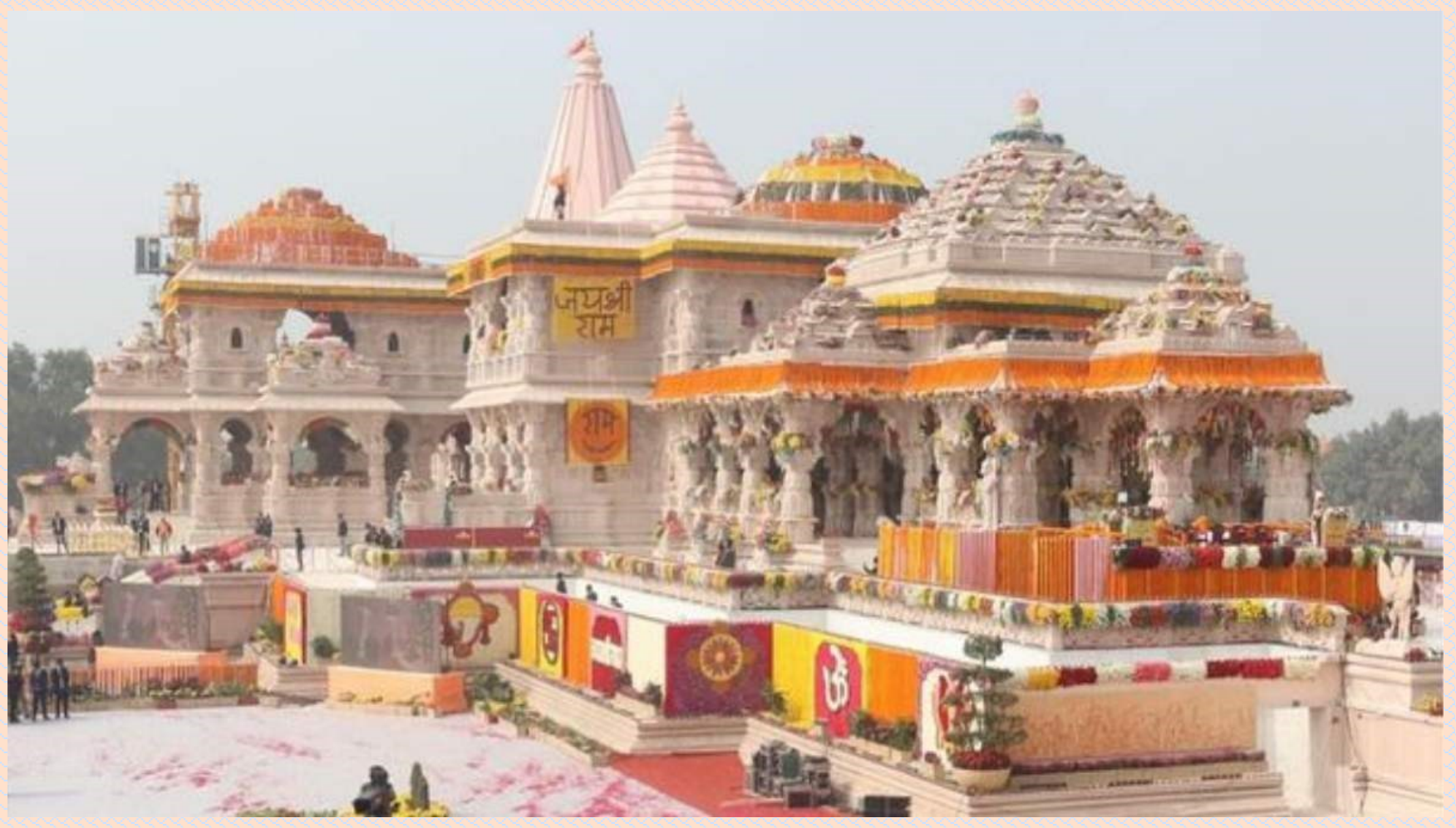
Sri Ram Janmabhumi Mandir, Ayodhya (100Km)