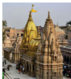
Vishwanath Temple Varanasi

Gorakhpur city is well connected with Flight services, Roadways and Rail. Gorakhpur city also surrounded by different ancient and historical places.