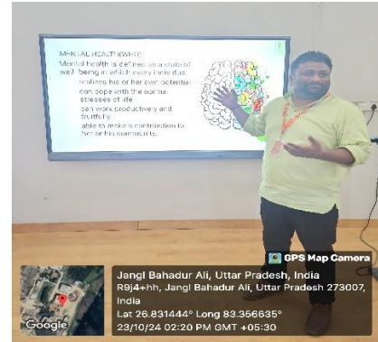
GPS Map Camera Jangl Bahadur Ali, Uttar Pradesh, India R9j4+hh, Jangl Bahadur Ali, Uttar Pradesh 273007, India Lat 26.831444° Long 83.356635° 23/10/24 02:20 PM GMT +05:30