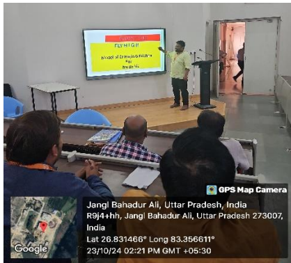
GPS Map Camera Jangl Bahadur Ali, Uttar Pradesh, India R9j4+hh, Jangl Bahadur Ali, Uttar Pradesh 273007, India Lat 26.831466° Long 83.356611° 23/10/24 02:21 PM GMT +05:30