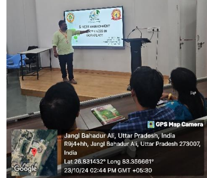
Jangl Bahadur Ali, Uttar Pradesh, India R9j4+hh, Jangl Bahadur Ali, Uttar Pradesh 273007, India Lat 26.831432° Long 83.356661° 23/10/24 02:44 PM GMT +05:30