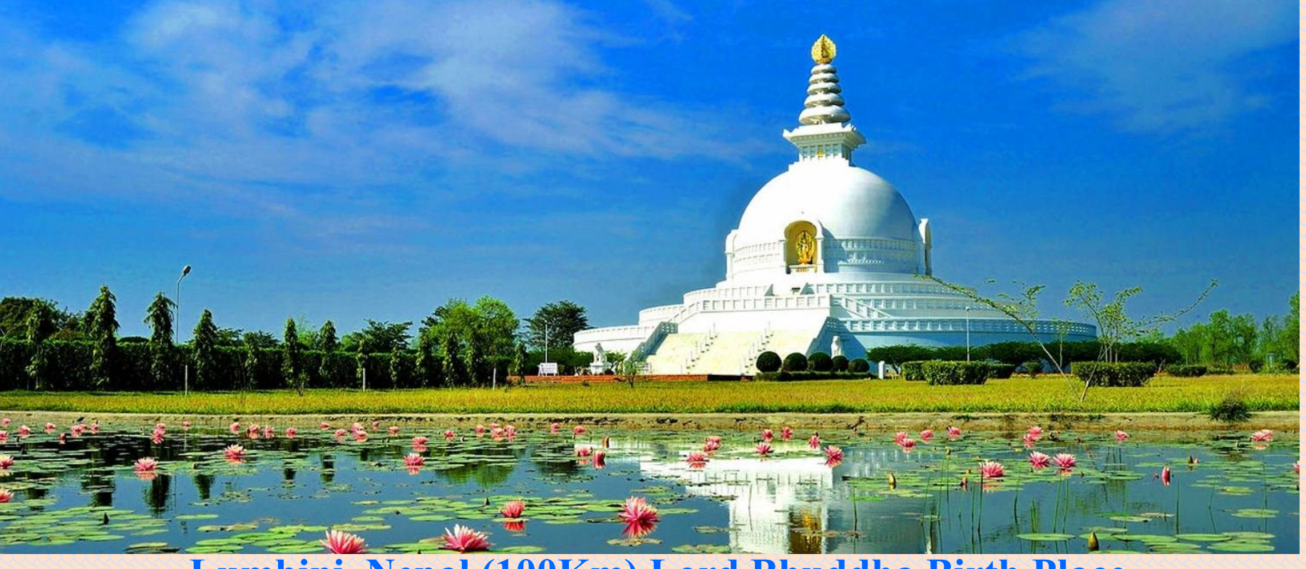
Lumbini, Nepal (100Km) Lord Bhuddha Birth Place