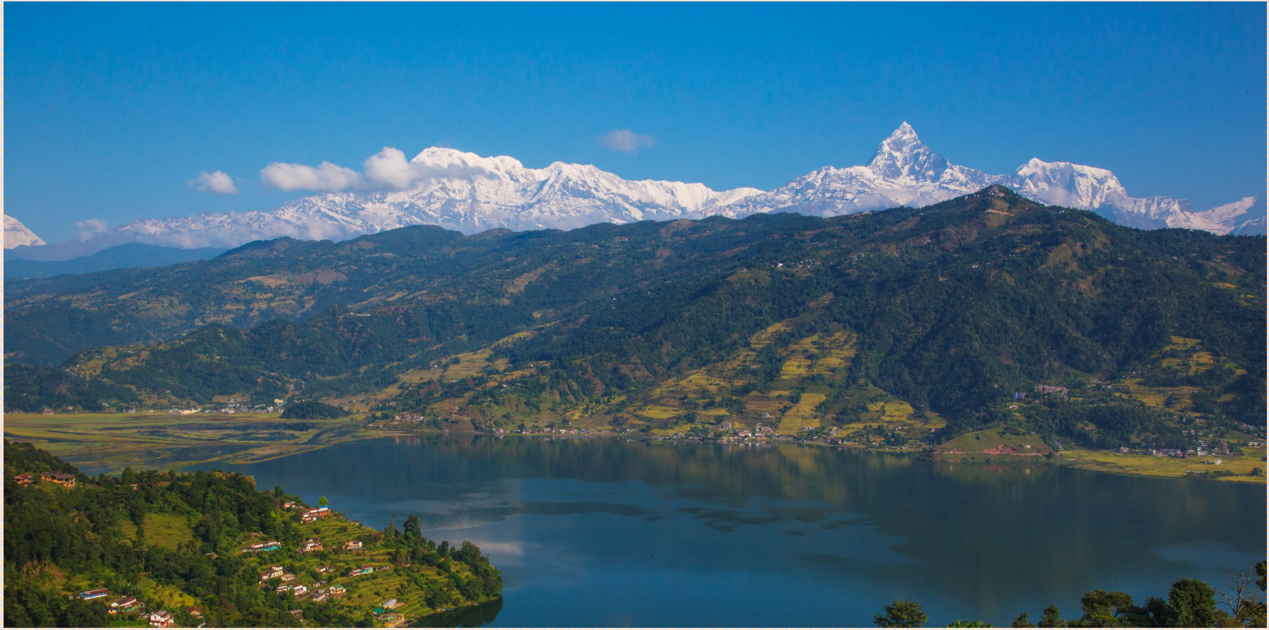
Pokhara, Nepal - Annapurna Himalayan Hill Range (250Km)