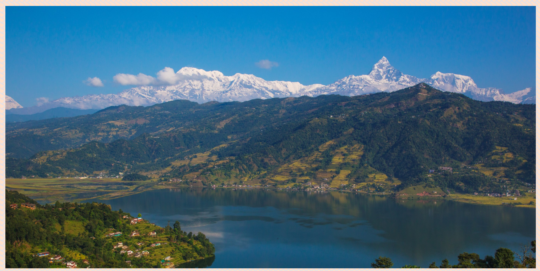
Pokhara, Nepal - Annapurna Himalayan Hill Range (250Km)