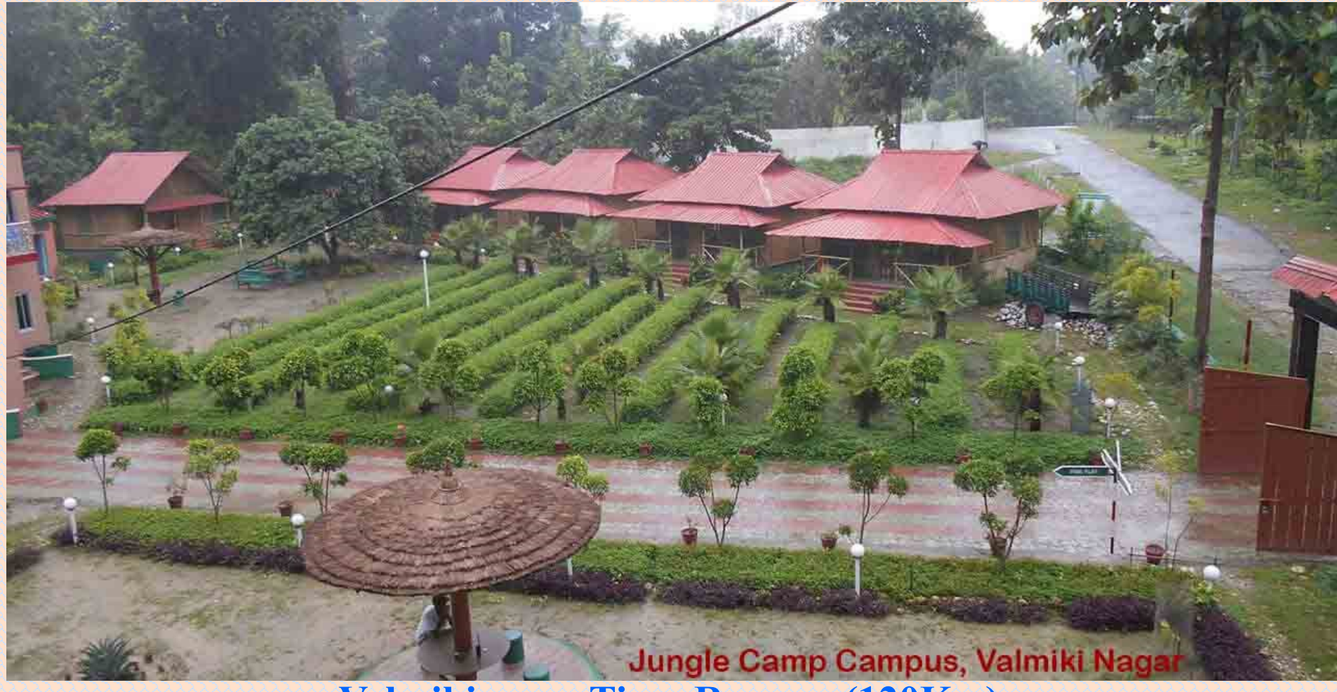
Valmikinagar Tiger Reserve (120Km)