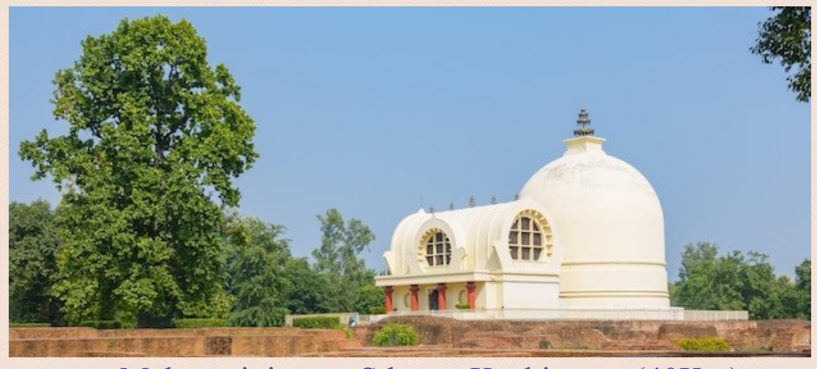
Mahaparinirvana Sthupa, Kushinagar (40Km)