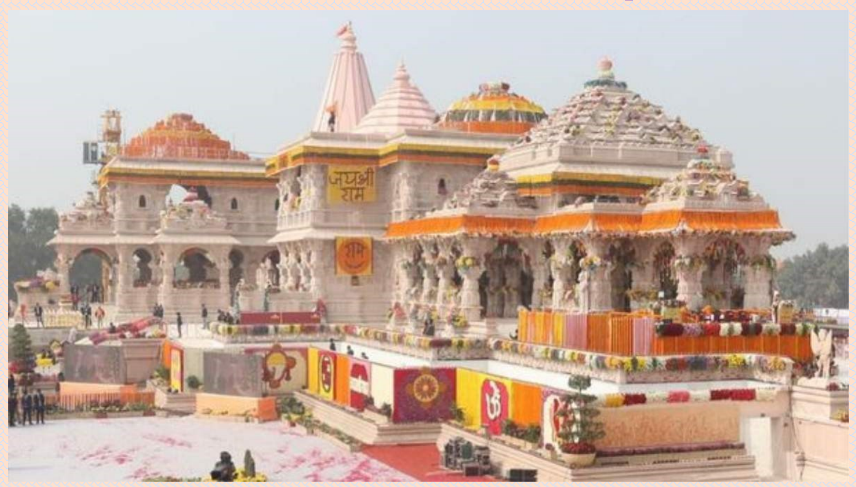
Sri Ram Janmabhumi Mandir, Ayodhya (100Km)