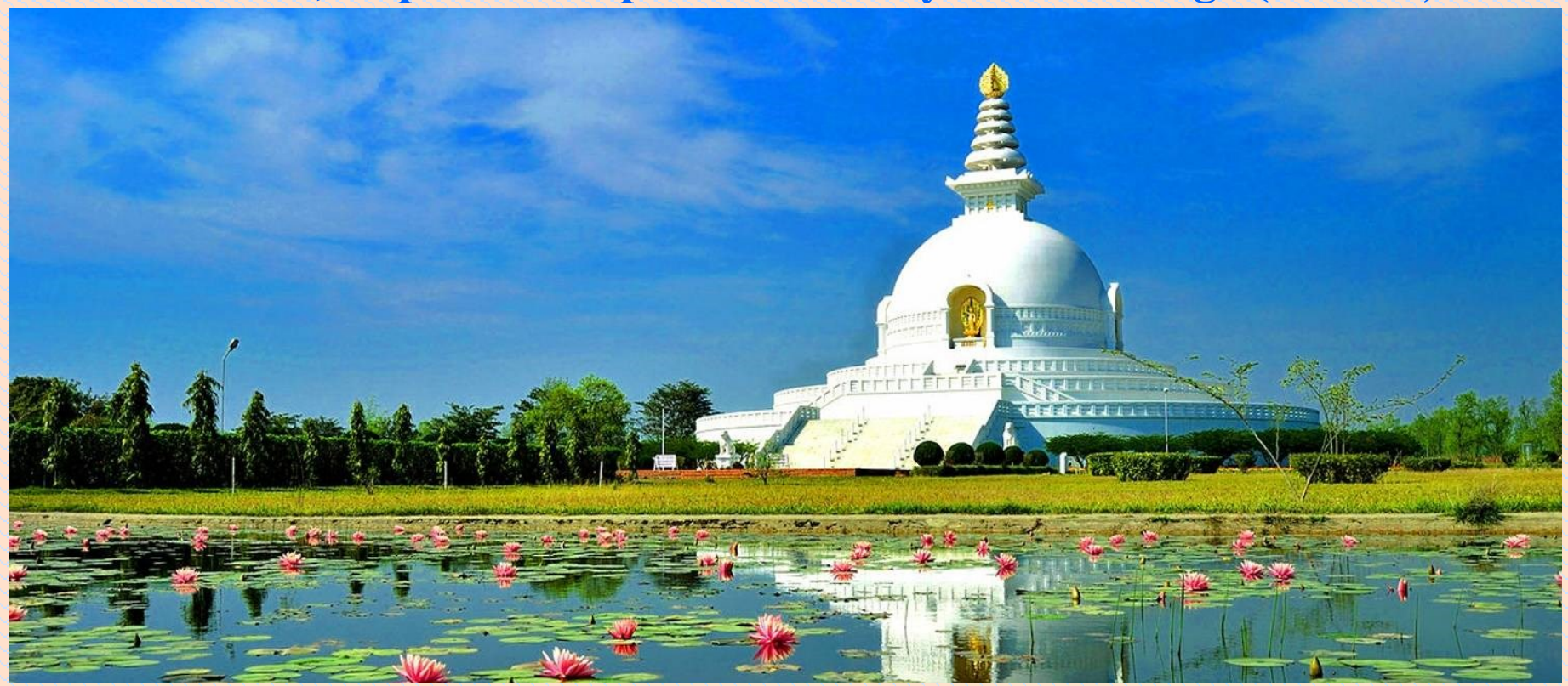
Lumbini, Nepal (100Km)